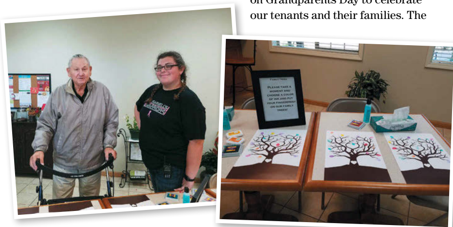
Residents of Courtyard Estates of Bushnell took part in a special family tree project during NALW 2017.

For more information about National Assisted Living Week, visit www.ahcancal.org/ncal/events/nalw .